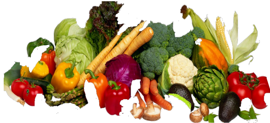
Fruits & Vegetables