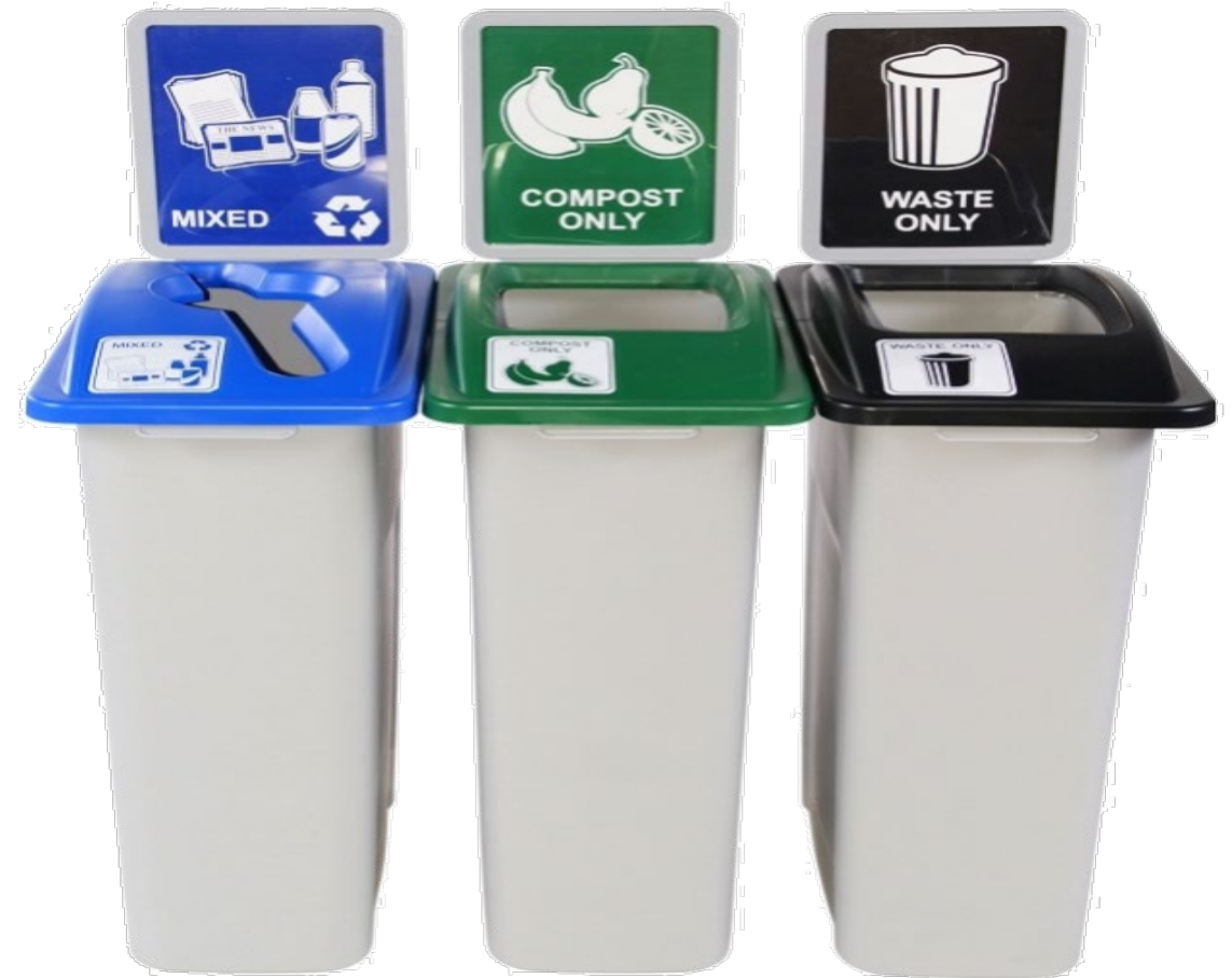
Sample of an Indoor Recycling/Organic Station

Enforcement requirements for non-complaint generators.